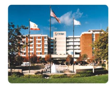
Scripps Memorial Hospital La Jolla